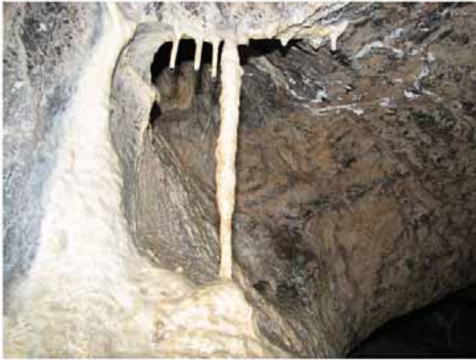
Fig. 7 Calcite column in karst cave