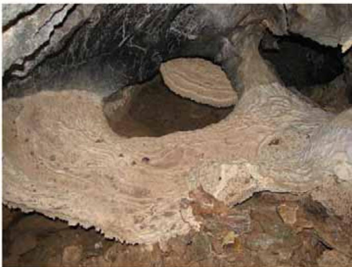
Fig. 11 Calcite gourds in karst cave