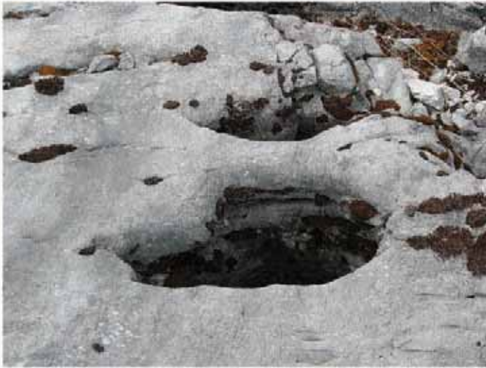
Fig. 1 Solutionally enlarged karst openings on proposed upper quarry site