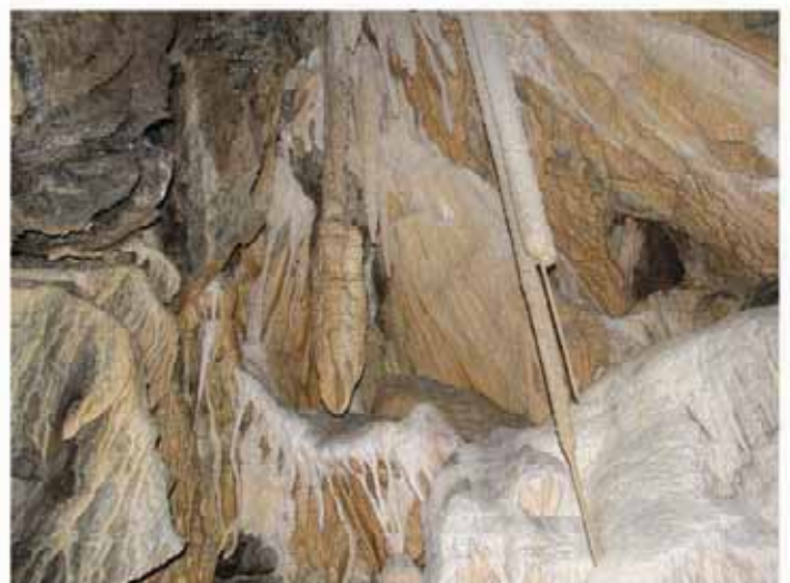
Fig. 6 Stalactites of possible record length in karst cave