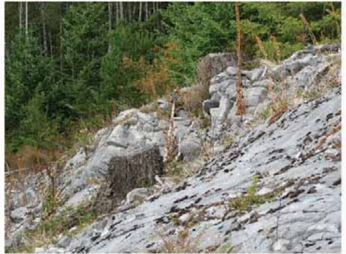
Fig. 4 Soil loss on proposed upper quarry site