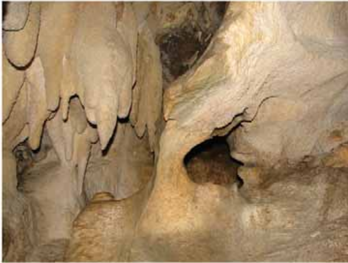
Fig. 9 Petromorph and mondlich encrusted stalagmites in karst cave