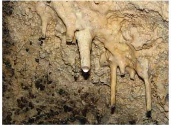
Fig. 10 Water percolate at tip of stalactite in karst cave