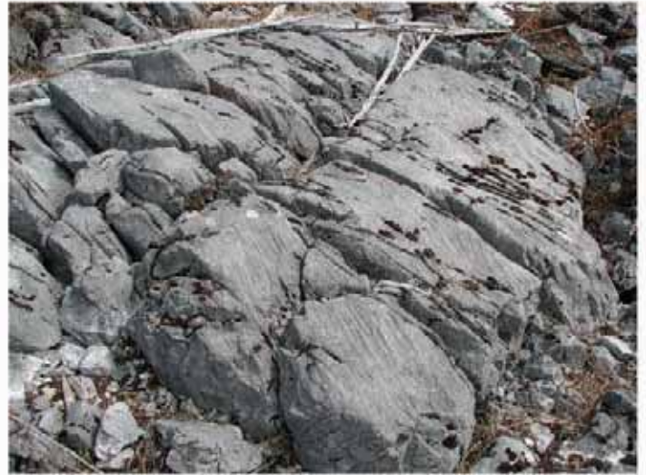
Fig. 2 Eipkarst exposure with rillenkarren on proposed upper quarry site