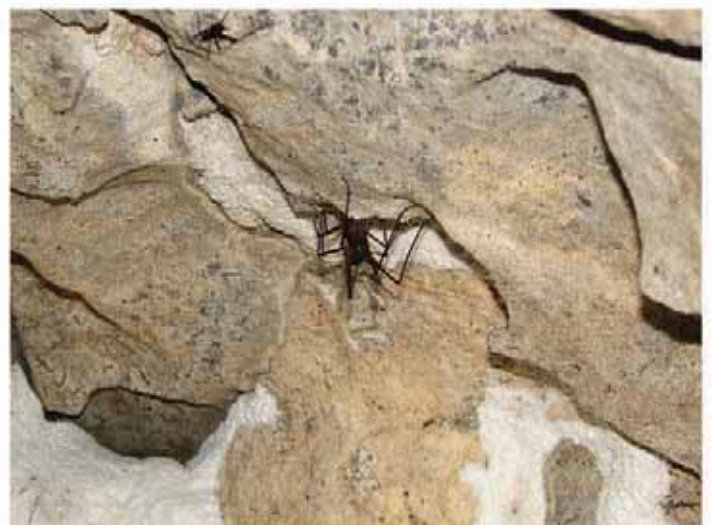
Fig. 18 Mating cave crickets