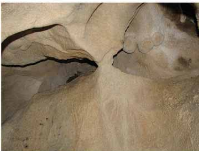
Fig. 5 Petromorph (rocky relief feature) on karst cave ceiling