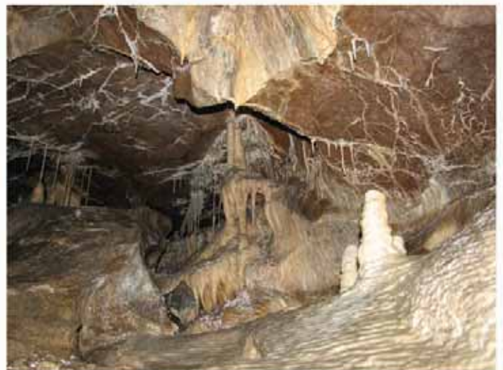
Fig. 12 Stalagmites and flowstone in karst cave