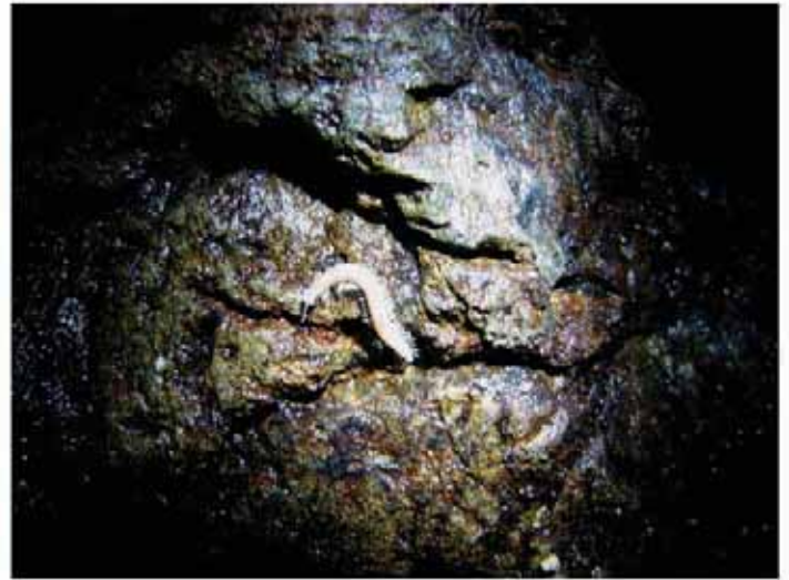
Fig. 16 Millipede in karst cave