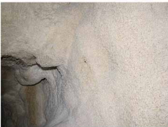
Fig. 17 Mondmilch and harvestman (centre of photo) in karst cave