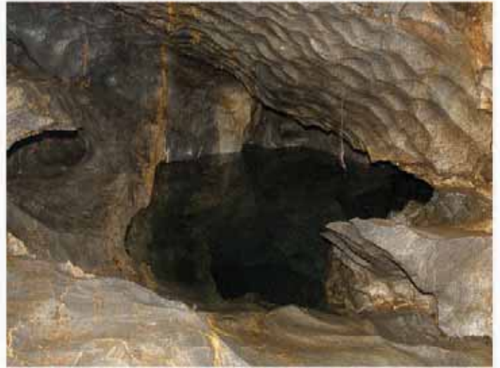
Fig. 14 Ponded water in karst cave