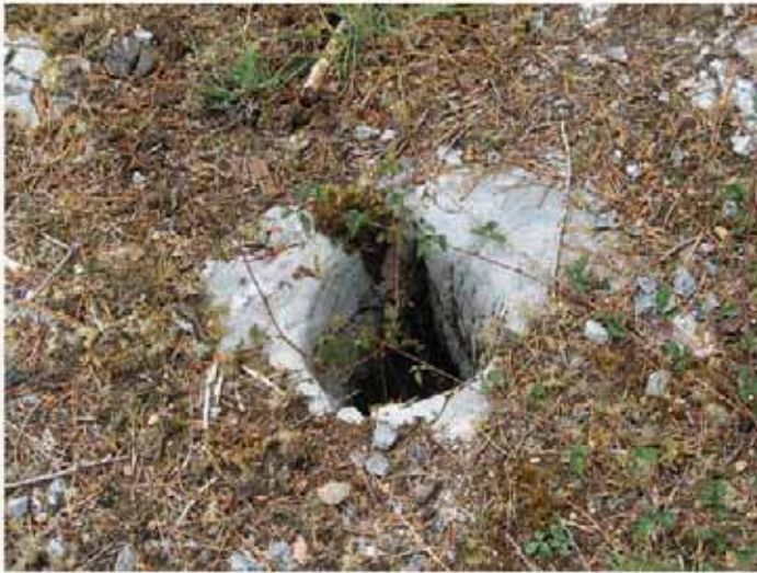
Fig. 3 Karst pipe on proposed upper quarry site