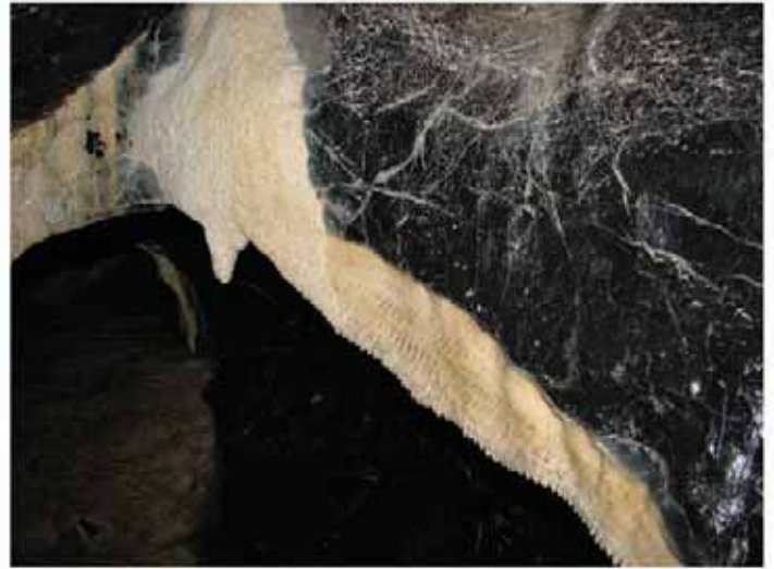
Fig. 8 Calcite curtain in karst cave