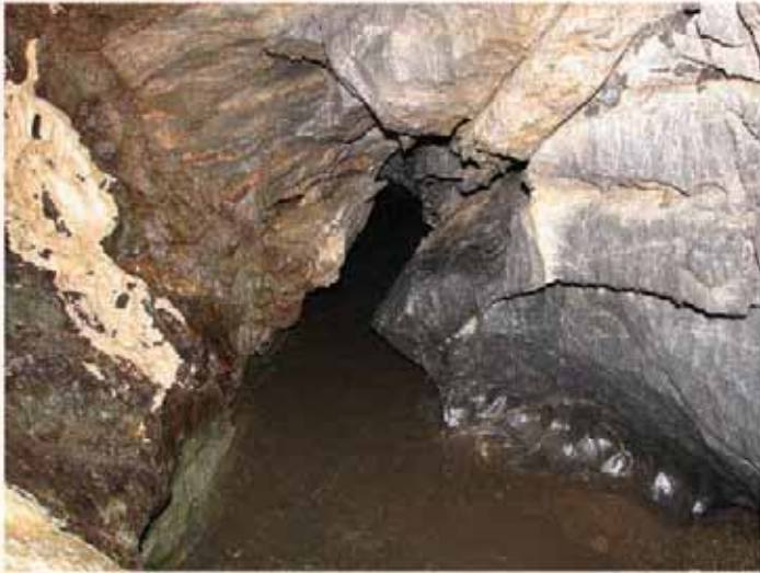
Fig. 13 Underground water flow in karst cave